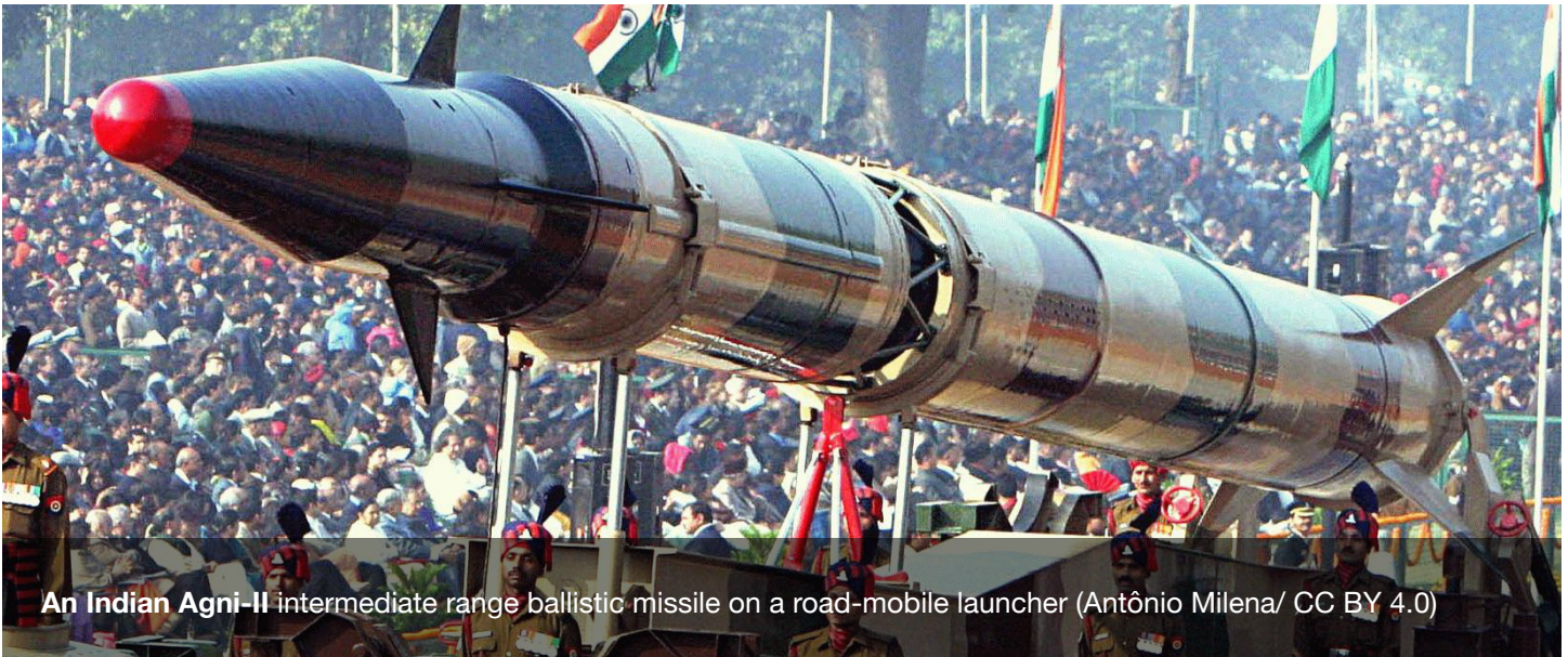
An Indian Agni-II intermediate range ballistic missile on a road-mobile launcher

hurl nuclear threats except in retaliation for nuclear use. If the most common scenario for nuclear use between India and China is consequent to a conventional war, NFU raises the bar of nuclear use. It would require more than a stretch of imagination to visualize an issue that could justify the risk of nuclear first use by either party. Admittedly, if both sides alert their weapons, there is the possibility of nuclear use through accident, misjudgment, misperception, miscommunication and the unknowable impact of what Clausewitz described as friction. The greater possibility for use would be due to China's salami-slicing tactics which would mean limited land grabs. Nuclear weapons have no role in such a scenario but could impose caution and prevent escalation.