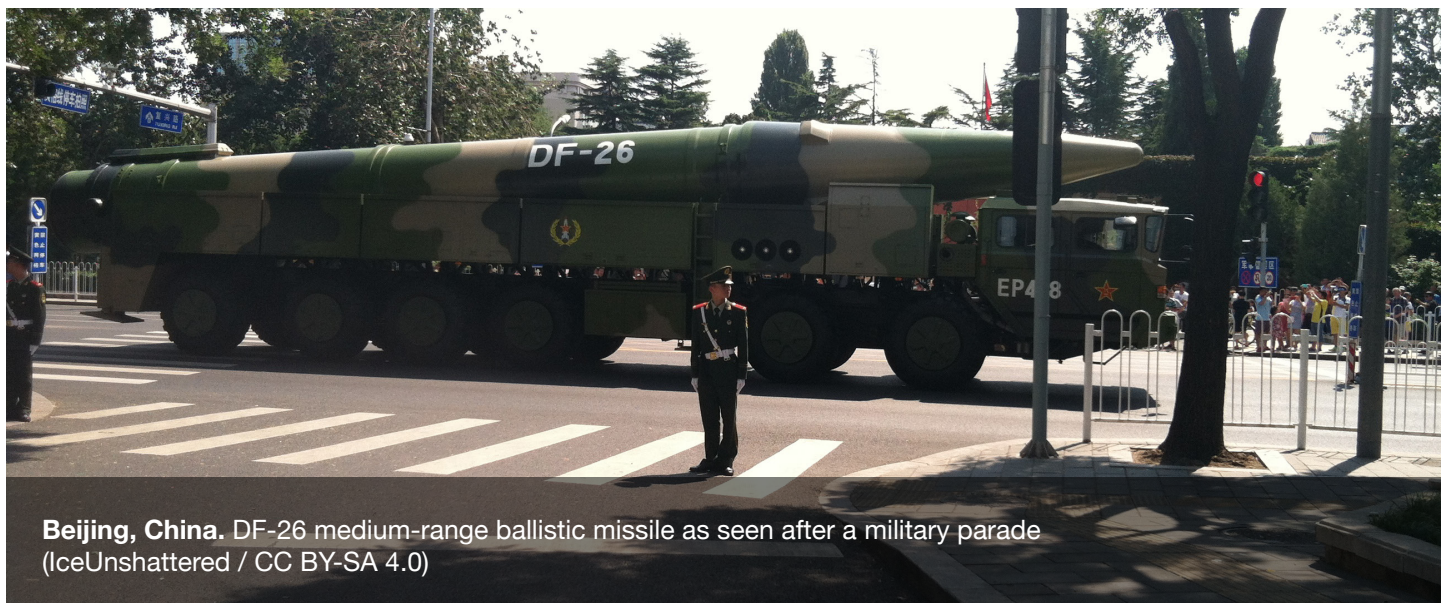
Beijing, China. DF-26 medium-range ballistic missile as seen after a military parade

The key question is whether the political embrace of the belief in the role of nuclear weapons that underpins China's and India's NFU posture restrains technological trajectory which in contemporary times is also